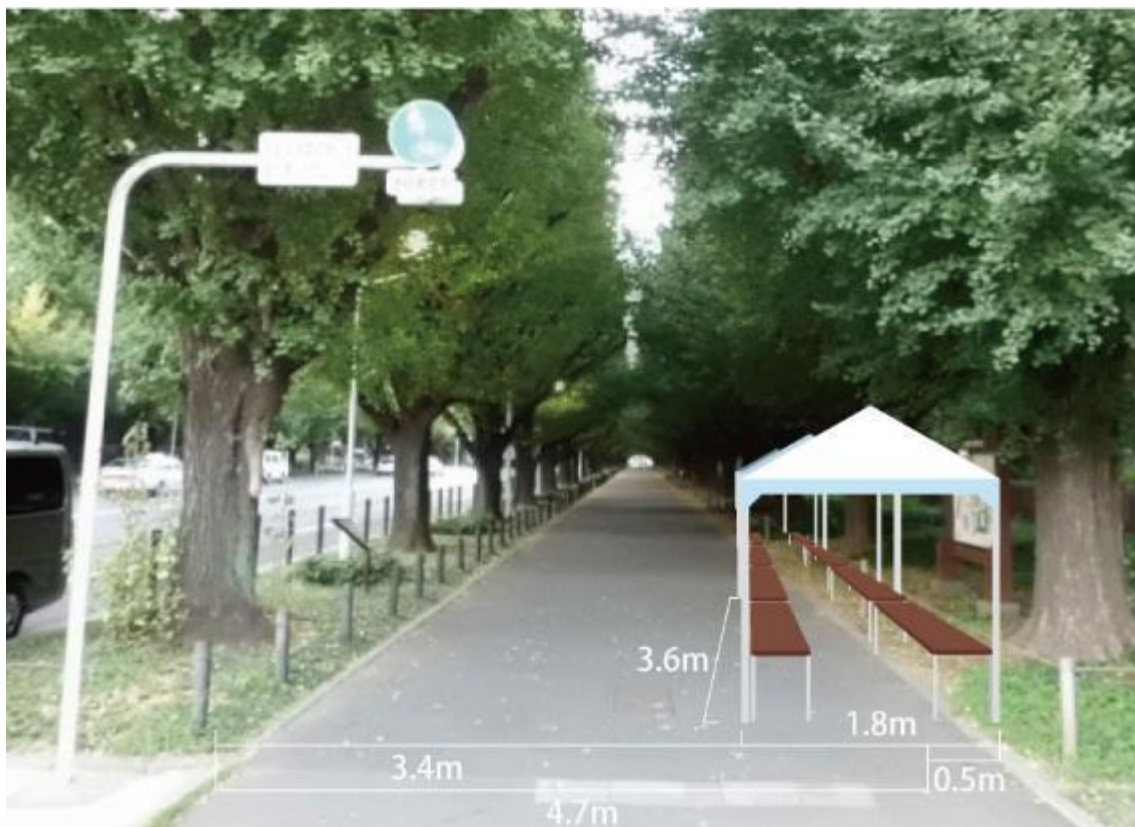
※Booth size and image